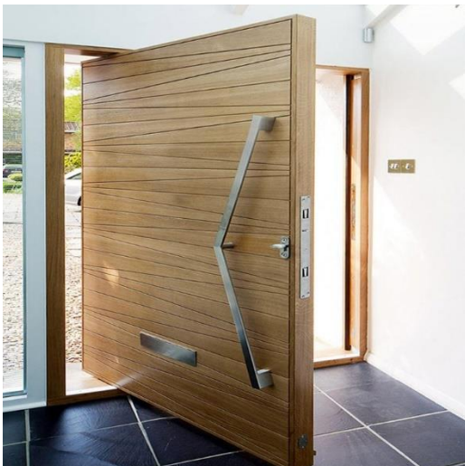
Door similar type.